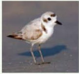
Level 2: Snowy Plover $50-$99