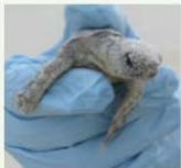
Level 3: Sea Turtle $100-$249