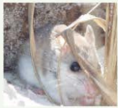
Level 1: Alabama Beach Mouse $25-$49