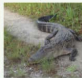
Level 4: Alligator $250+